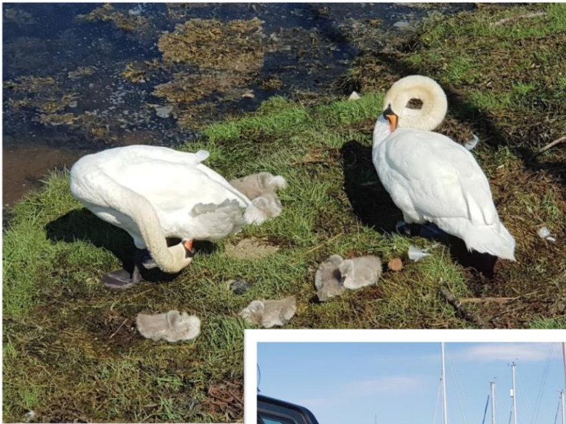
Rare picture of seven signets

Now onto the days more interesting roads and south we went into the Cairngorms the A939 through Littlemill and Ferness gave us a great deal of fun until we turned right onto the Old Military Road and it only got better with more bends and hairpins and rollercoaster humps to keep us alert and grinning ear to ear. Grantown on Spey was our fuel stop before continuing on the Old Military Road to Tomintoul and an Ice Cream and a flake while sitting in the grassy square chatting the while away. The same road took us over the Lecht the Cairngorms prime skiing location, no snow here today just sunshine and stunning views over the moors while the road rose up and down with some vicious gradients giving your stomach a workout only a fairground could equal! Cock Bridge went by in a blink and we were now on the flat and only a sharp up and down bridge over the River Gairn onto a narrow road for a mile or so before getting to Ballater. A great end to the day and you guessed it we were HOT!