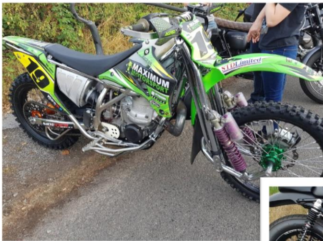
Nope, I aint going on that sidecar!

Don't remember my CG125 looking like this?