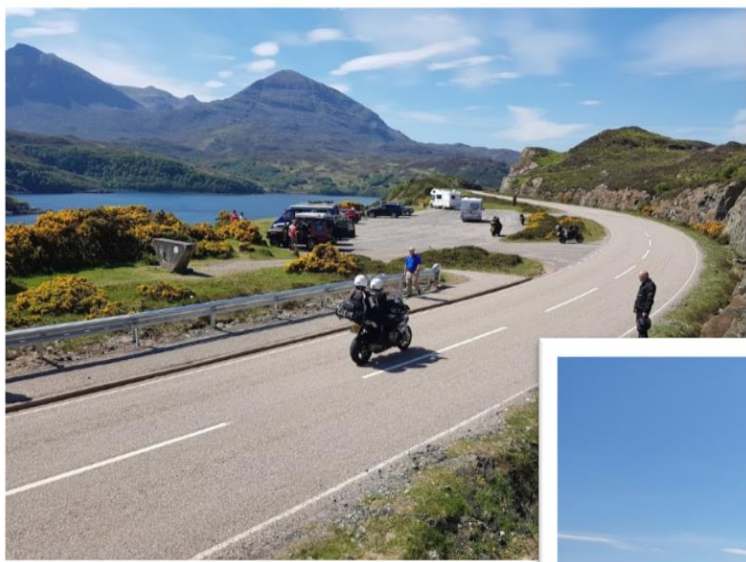
Kylesku Bridge and Loch Gleann Dubh