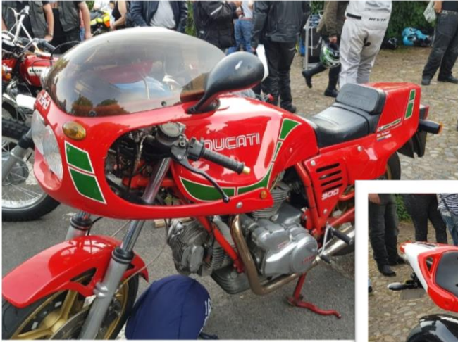
Ducati's old and new

Another hot evening ripe for a bit of motorcycling so this event which was expecting five hundred bikes surpassed this with around seven hundred turning up of all shapes and sizes to enjoy the evening admiring the other bikes and chat about everything two wheeled.