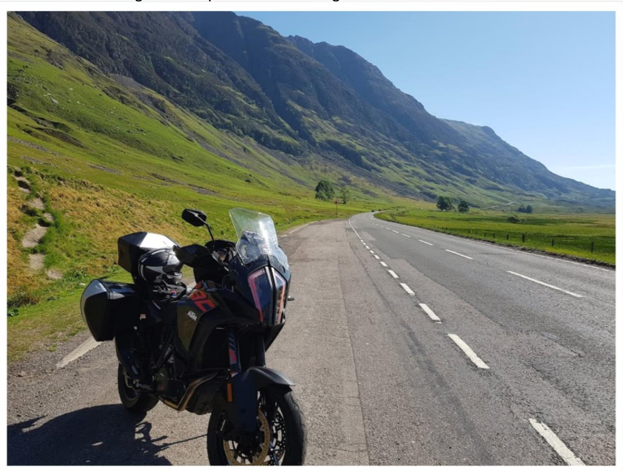
The Magnificent Glen Coe