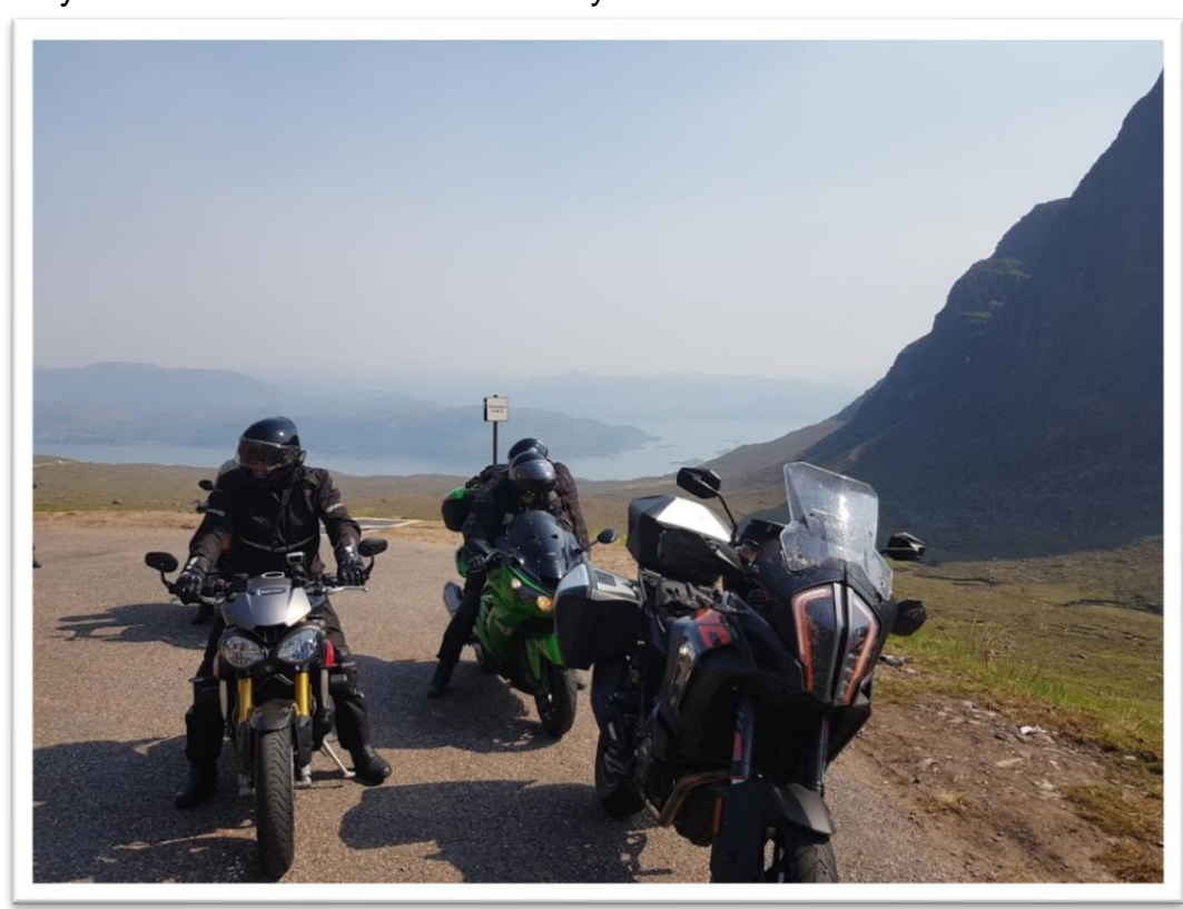
Bealach Na Ba