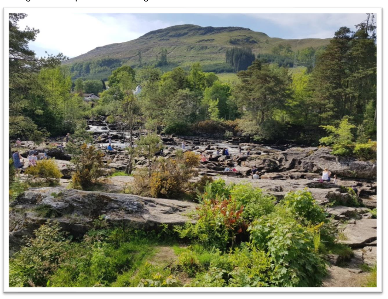
The Falls of Dochart - Killin

Fuel was eleven miles away and much cheaper, so we were going there to fill up apart from Alun who had filled up with liquid gold, well it should be at that price! Ash was wishing she had dipped into her gold reserves a couple of miles later when her Yamaha spluttered to a halt before she could get it on reserve. A few minutes and dad came to the rescue and got her started again and then went sailing past the slip road we were waiting on to go and fill up! Well this is a good start!