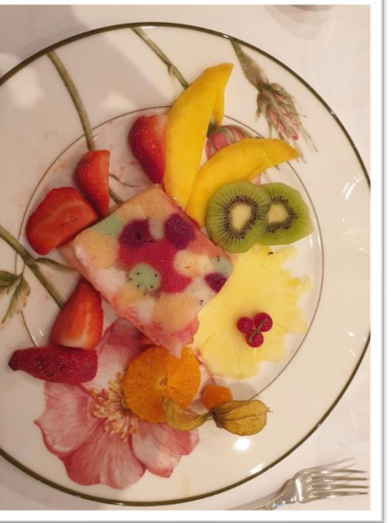
Let's finish with food and drink The End