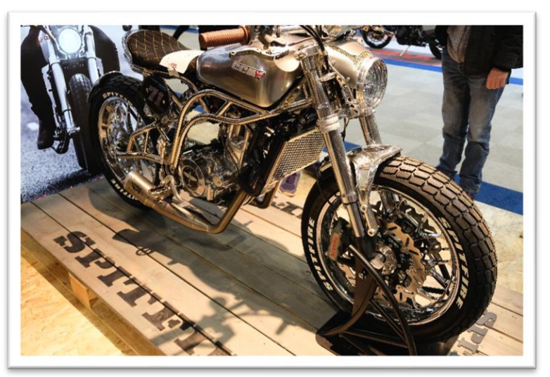
Aluminium, Chrome, shiny – hope you get a few tubes of Autosol with this bike!