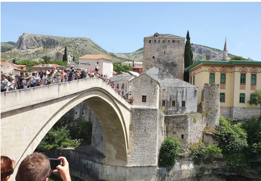
Mostar Bridge (and jumper!)