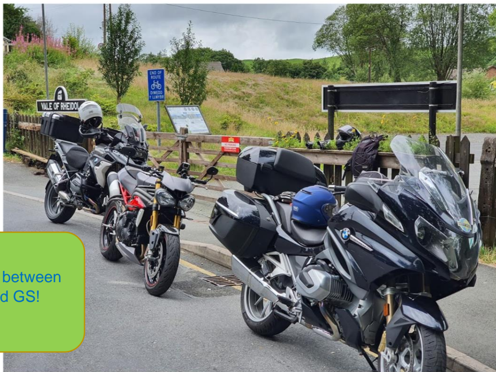
Toy Triumph between the RT and GS!