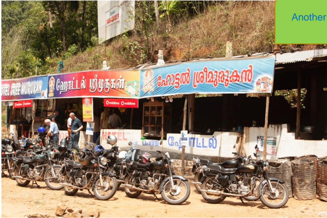
Another Snack Stop