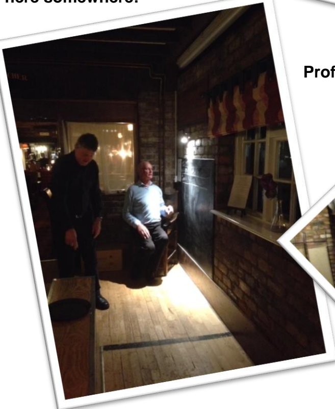
Professor X Using mind control