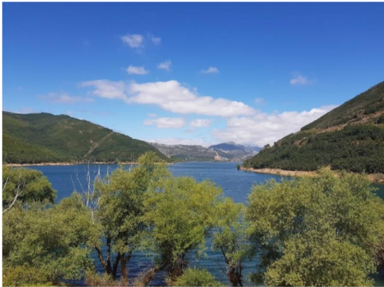
This view one direction