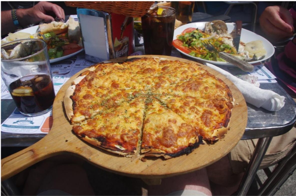
Just a light snack for lunch!

We waved cheerio to our host as we rode off down the road, still wondering what the steak was the night before, I am sure I don't want to know what it was, the weather had cheered up from the day before and Ian's headlight was behaving itself so all was well, given the mileage of the day we stuck to main roads where we could make good progress, we stopped for coffee in a little village, the locals looked at us as if we had come from another planet, yes it was that kind of village, but after a couple of minutes they went back to their conversations, and just forgot about the aliens, suitably refreshed we carried on our way, the weather was dry and the scenery good, the journey was good and we arrived at Zarautz early afternoon, we found our hotel without much bother, checked in, changed into typical tourist shorts and T shirt and went to explore our new surroundings that was going to be home for the next two days, the beach was a five minute walk for the Hotel, the sun was out the sand golden and the restaurants open, it doesn't get much better. We found a suitable restaurant and set about a late lunch, Pizza Margarita for me then.