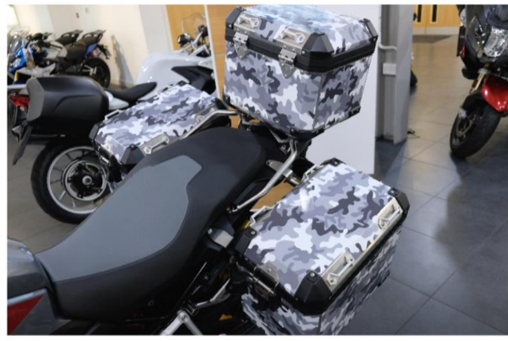
Thought Camouflage was meant to make you less conspicuous!